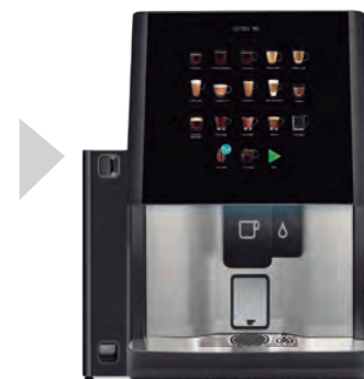
External MDB payment module